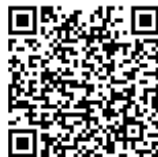
Parents and Kid's Guide QR Code

We encourage children to send their completed activities to PghShakespeareParksEdu@gmail.com for inclusion in a future web gallery.